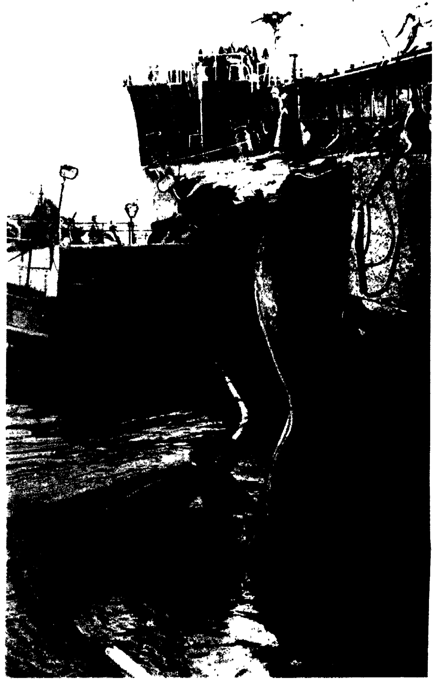
Gaping hole in tanker Oregon Standard; floating boom pens in oil